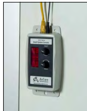
Fig. 2: Airlink Wall Mounted Control Console