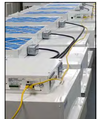
Fig. 3: Airlink Control Housing Mounted on Master SAM Unit

Consult with our factory for more information.