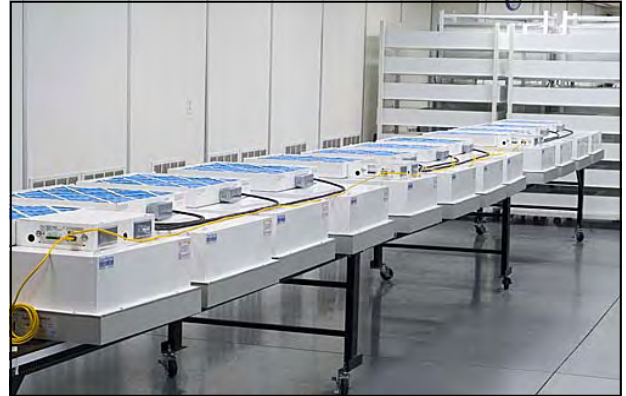
Fig. 1: Assembled Airlink System at CAS factory

A typical Airlink Control System consists of an address or groups of addresses with four or more SAM units per address as shown in Fig. 1 & 3. Each address is controlled by a panel or wall mounted console as shown in Fig. 2. Each address includes the following components: