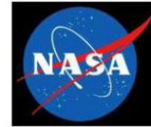
NASA GODDARD MMS CLEAN ROOM